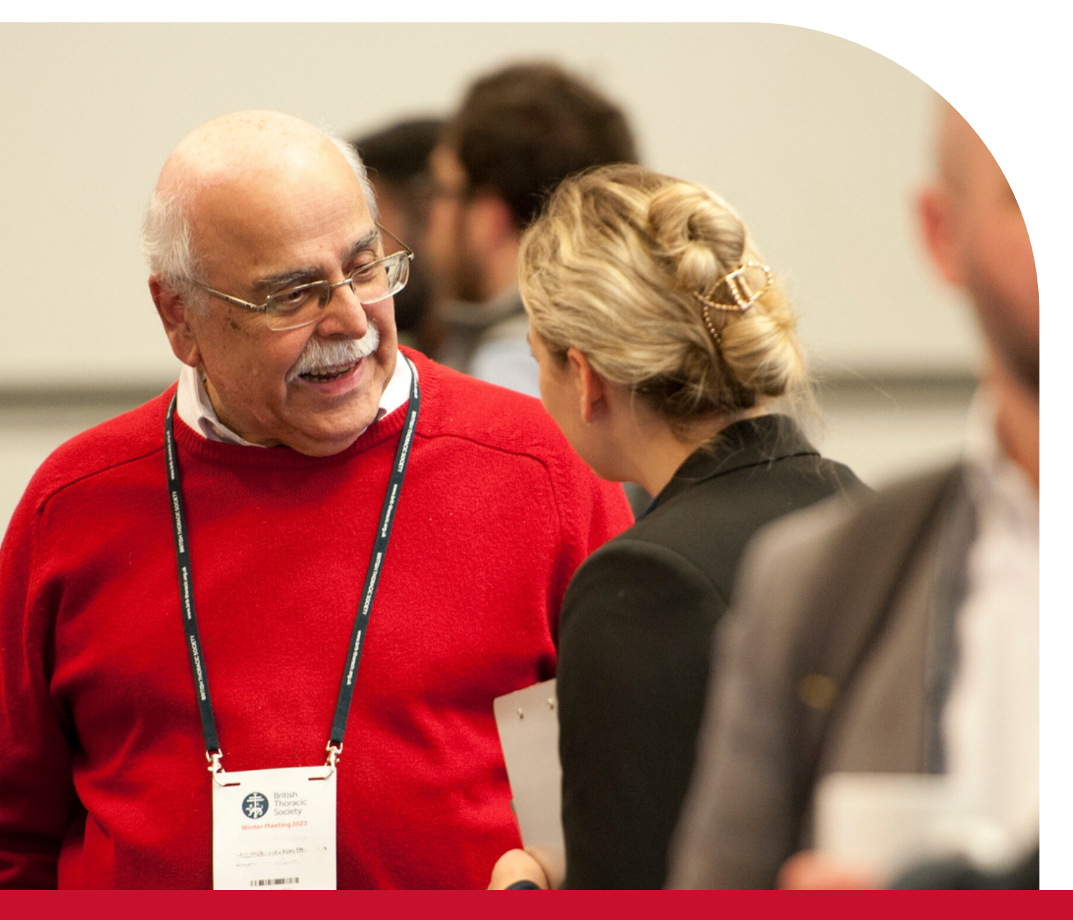
Exhibit at the British Thoracic Society Winter Meeting