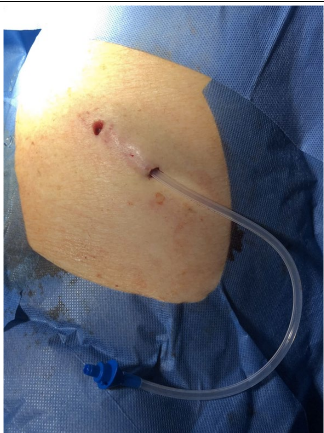
Figure 2: An IPC immediately after insertion, with a 5 cm subcutaneous tunnel, prior to sutures being applied

Length of tract is usually recommended to be 5-10 cm (Figure 2). 2,3